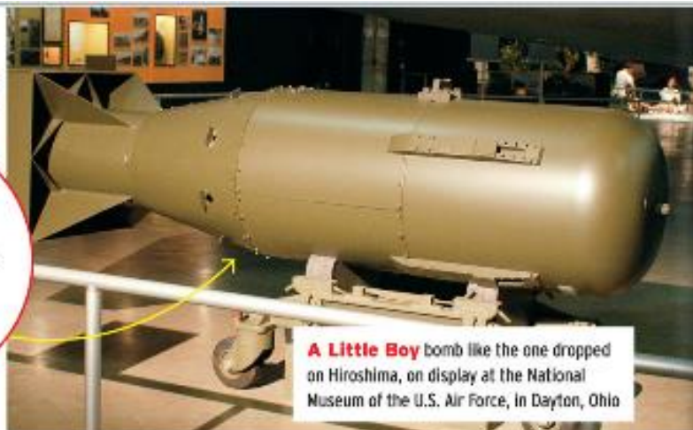
A Little Boy bomb like the one dropped on Hiroshima, on display at the National Museum of the U.S. Air Force, in Dayton, Ohio